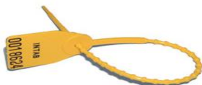
Yellow beaded seal pictured above.

The Secretary of State requires that ballots being transported be sealed to maintain security. When retrieving ballots from ballot drop boxes, a yellow beaded seal must be placed on the bag removed from inside the ballot drop box. The seal number must be logged on the ballot drop box transport form. Ballots being picked up from voter assistance centers will be in transport bags secured by yellow beaded seals. The seal number must be logged on the voter assistance center ballot transport form.