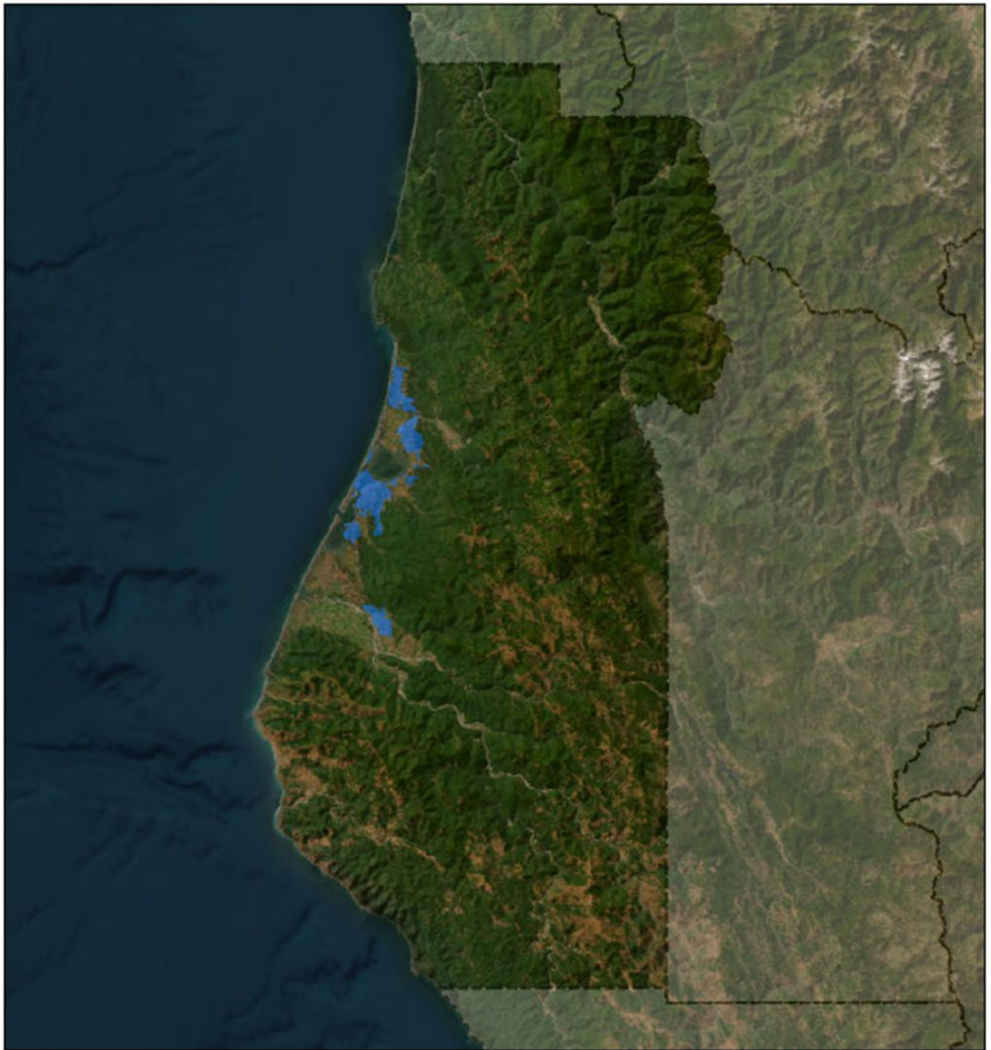
Figure 2 Urban Areas of Humboldt