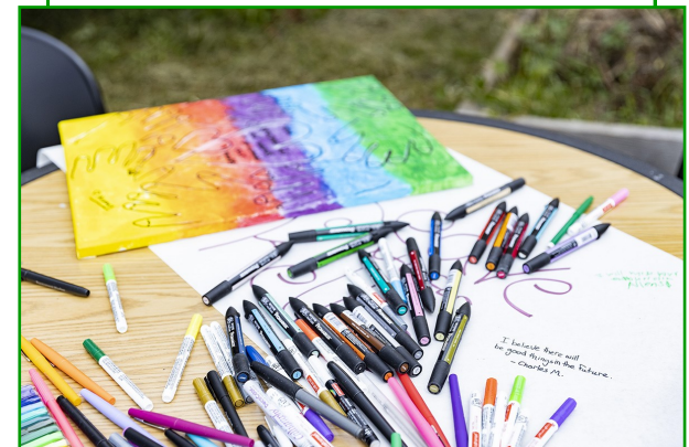
Participants can join in a variety of art-based classes.

We are individuals who have personal experience and are trained to use those experiences in a positive way to walk with individuals on their journey to where they would like to be.