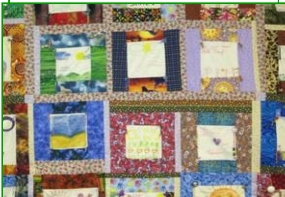
The "Quilt of Discovery" was the first quilt ever made by participants at the Hope Center.

We keep our doors open for anyone and everyone who has, is or might experience challenges in their life.